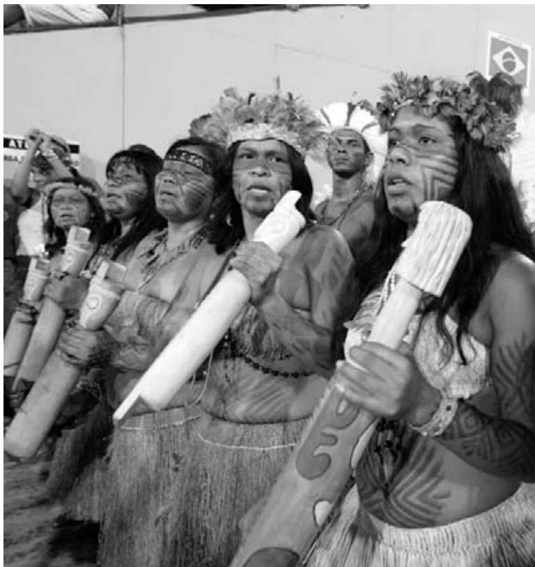
Members of the Guarani tribe play music and sing songs.